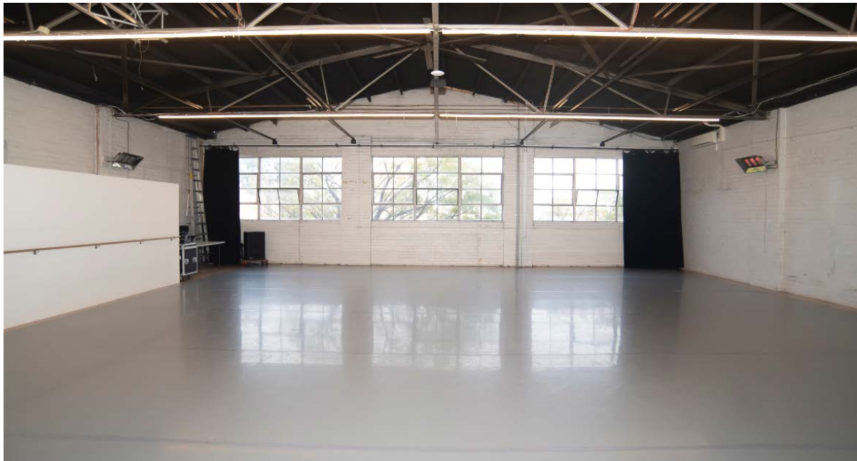
Chloe Munro Studio