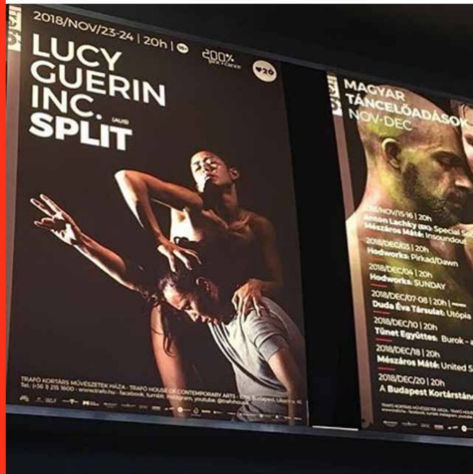
Image: Split at Trafo in Budapest, Hungary in 2018

A concerted effort has been made by the Company to use its marketing platforms more strategically and actively with the goals of increasing audience, social reach and attendance at Company programs, while ensuring the information provided is relevant and useful.