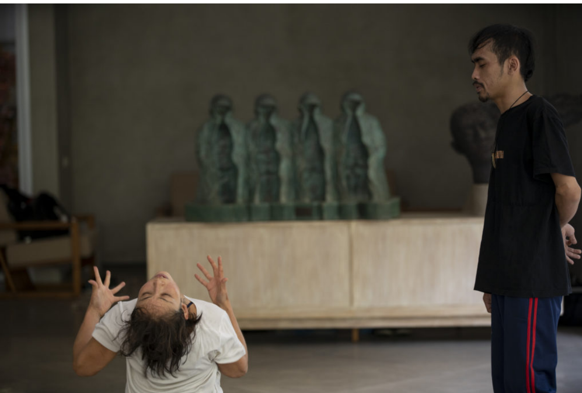
Metal rehearsals in Bandung.

"Beginning in a space of pure form and function the dancers are drawn into the intensity of the sound, using the local story of the volcano, and the volatile shifting crust of the earth as a score," said Lucy Guerin.