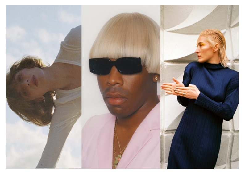
Writer's Wrap Up 2019