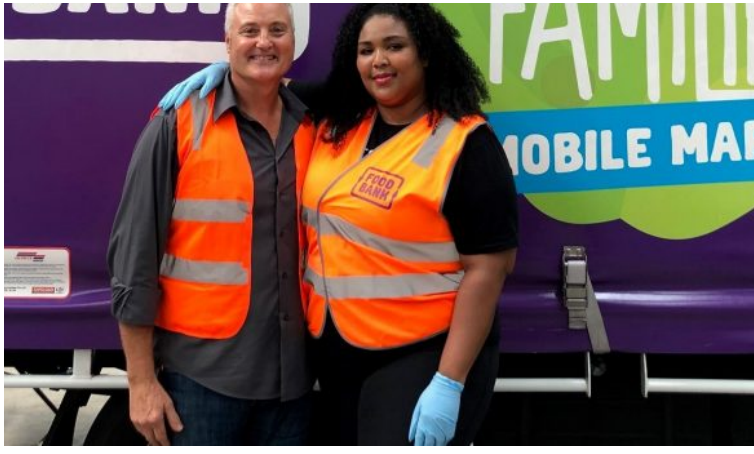
Lizzo dropped into Foodbank Victoria to help bushfire relief volunteers