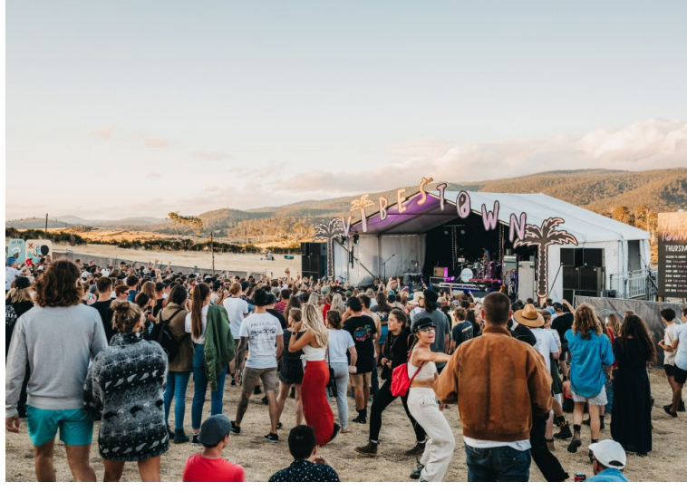
Goodbye Party In The Paddock: a festival favourite says farewell