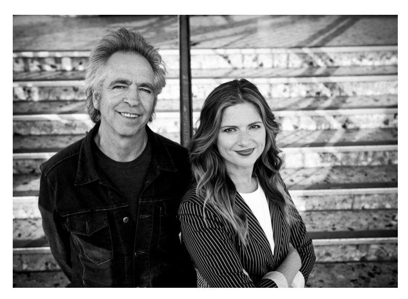
RocKwiz's 'Really Really Good Friday' Easter special will return this year