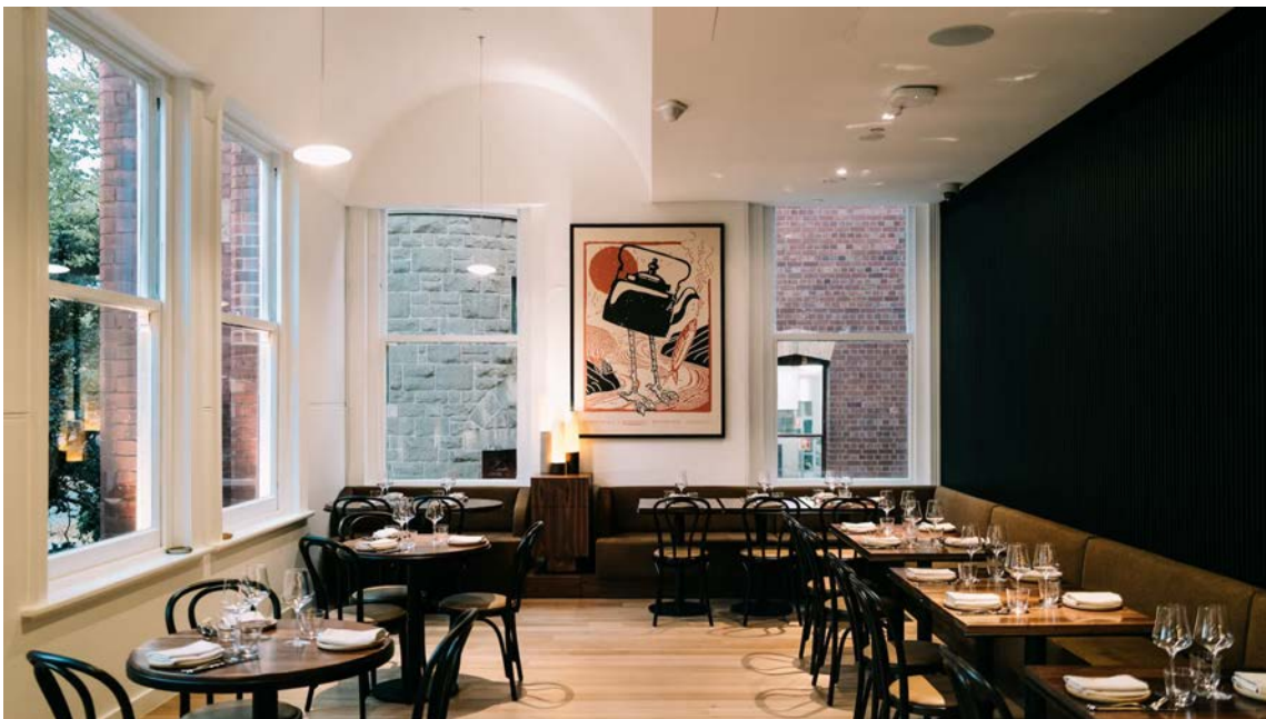
RESIDENCE at the Potter's dining room on the mezzanine level of the Potter Museum of Art.

Other food and beverage options on weekdays include Standing Room, Zambrero, Thailander, Gong Cha, Curry Workshop and the Campus General Store. Learn more about your dining options on UMAC's website.